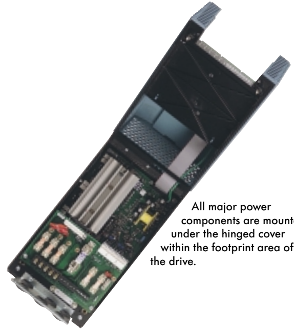
All major power components are mounted under the hinged cover within the footprint area of the drive.